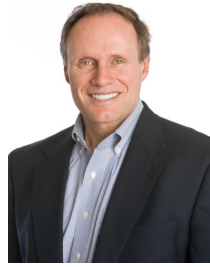
Stephen M.R. Covey

Co-founder and Global Practice Leader Franklin Covey's Speed of Trust Practice